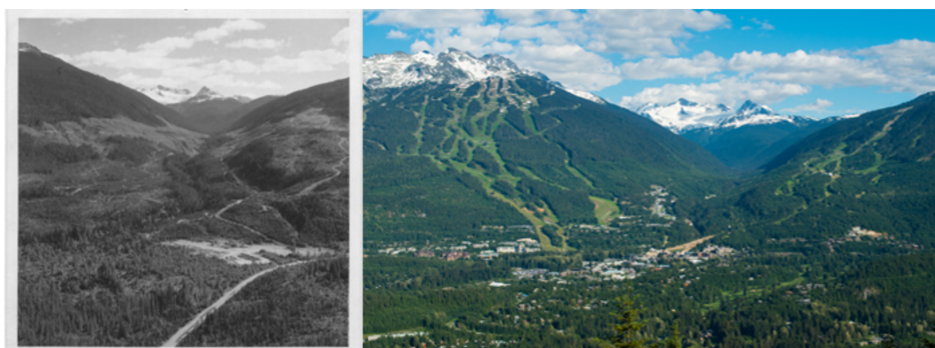
Time flies when you're having fun. Whistler Village then and now.

Whistler is always ready for a party and Sunday September 6, 2015 is a big one. The Resort Municipality of Whistler (RMOW) turns 40 years old and we are celebrating with a weekend of festivities. From historical discussions and a themed exhibit at the Whistler Museum to a free Spirit of the West concert (complete with hot dog and corn roast) to street entertainment, a special art exhibit and more (no official word if there will be free cake, gelato is confirmed but what's a birthday without cake? It's probably supposed to be a surprise).